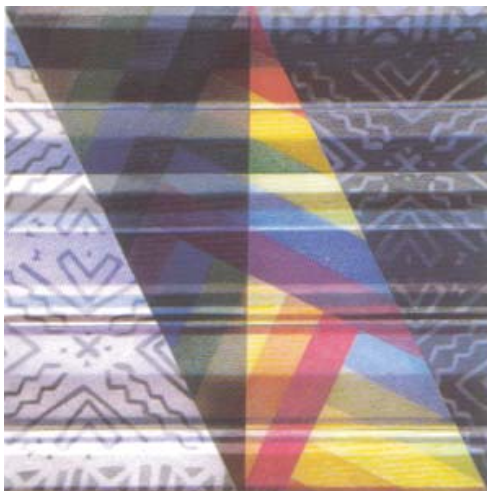
Lula Mae Blocton